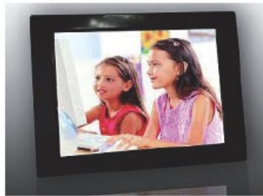
Digital Photo Frame