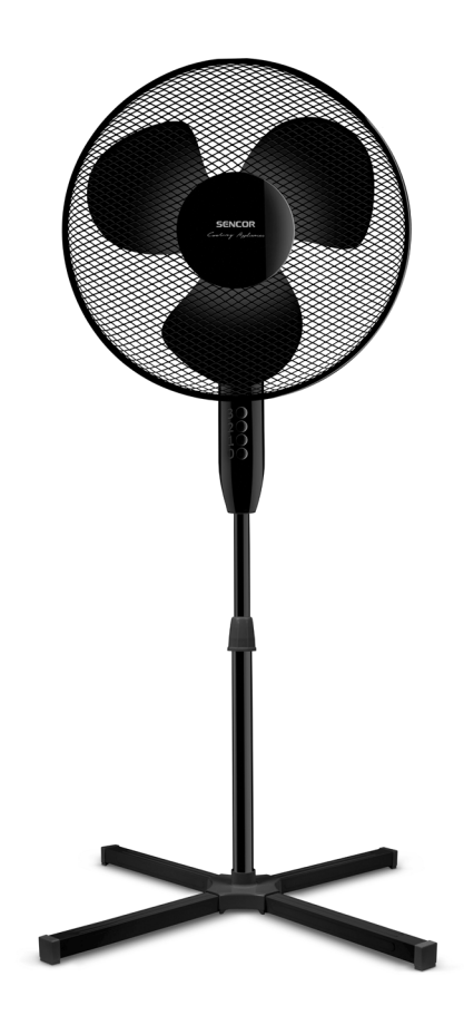
EN - Pedestal Fan